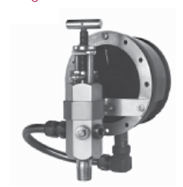
Hex Mounting Kit Components